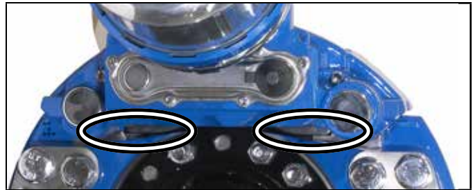
FIGURE 2 - INSERT THE PAD AND WEAR GAUGE

Slide the long arm of the tool into the carrier-caliper assembly through one of the channels shown in Figure 2 and rest the end of the tool against the back of the brake pad.